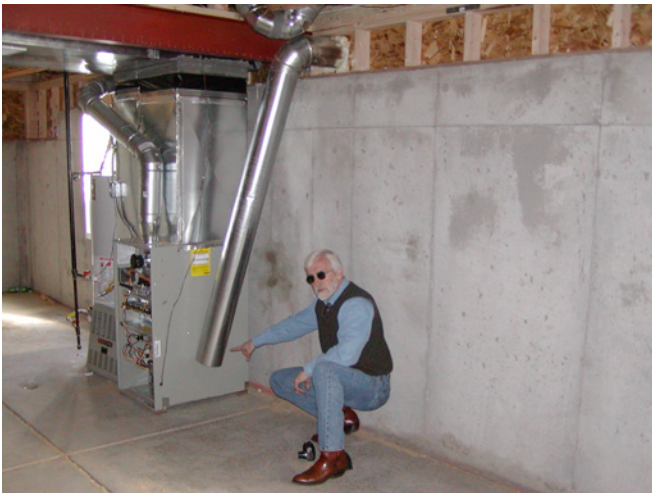
Photograph 9: Combustion Air Supply – Handsome guy with sunglasses (not me, but an ex classical concert musician who knows stuff about buildings) is pointing at a ducted (to the outside) combustion air supply duct. As handsome as he is wouldn't it be better to have sealed combustion power vented appliances and not have to worry about providing a duct like this?