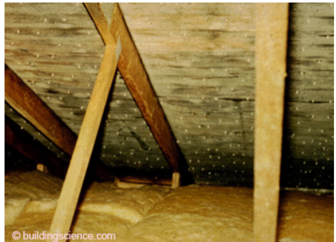
Photograph 1: Moldy and Decaying Attic – Notice the frost on the nails penetrating the roof sheathing. Moisture ends up on the coldest surfaces first. The sheathing is taking a beating, but the top chords of the roof trusses are doing fine because they are just a little bit warmer.

The final bit of good news for the old leaky poorly insulated attic was the presence of a chimney. And not just any chimney, a big, hulking masonry chimney connected to a big oil furnace. Lots and lots of air was sucked out of houses with these chimneys. Think of this old type of chimney as a powerful exhaust fan that served to depressurize the enclosure and provide air change. The air change diluted interior moisture levels and the depressurization raised the neutral pressure plane reducing the amount of exfiltration into the attic. Many old timers viewed these chimneys as the ultimate ventilation system – an exhaust fan that never burned out.