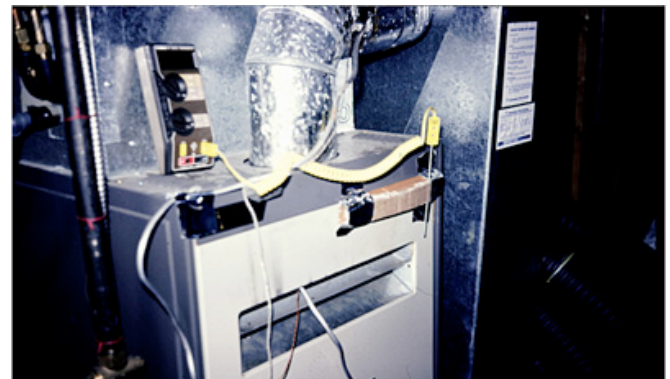
Photograph 7: Spillage of Flue Products – Notice the soot stains at the draft hood of this replacement gas furnace. How to fix this problem? Provide combustion air – See Photograph 9. What are all those tubes and toys you ask? I was once a young graduate student who thought you could measure pretty much anything. Boy was I wrong – and I will leave it at that.