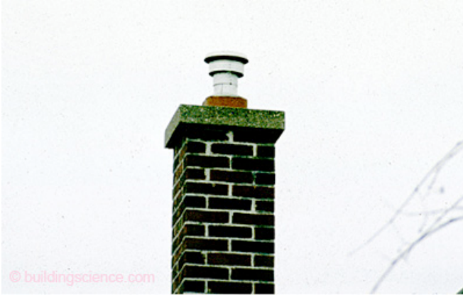
Photograph 8: New Chimney Liner – notice the new smaller sheet metal flue installed inside the larger original masonry chimney that served the older oil furnace that got replaced.