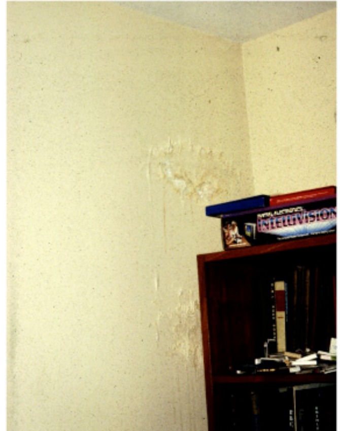
Photograph 6: Flue Condensate Damage – Big danger here. Condensate from flue gases from replacement gas furnace leaching through wall assembly. How to fix this problem? Line the chimney – See Photograph 8.

Then air-tighten and insulate to your hearts (and budgets) content. Notice the order. We do the stay out of trouble part first. Then we caulk. Then we insulate. All this sets the stage for what will inevitably come later. There will be more energy conservation to follow, not less. If we get these first priorities out of the way, there is no way that we will screw up what comes later. The later order and the later technologies won't matter. Think of the outcome. No houses rot this time. No one gets sick. We save energy. Life is good.