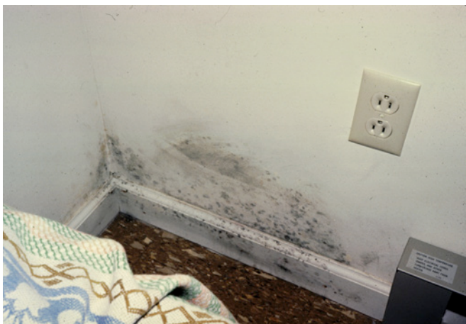
Photograph 2: Mold on Interior Surfaces – Interior moisture levels go up due to reduced air change and relative humidity adjacent cold surfaces rises sufficiently to support mold growth. Compare this mold growth pattern to the temperature profile in Photograph 3.