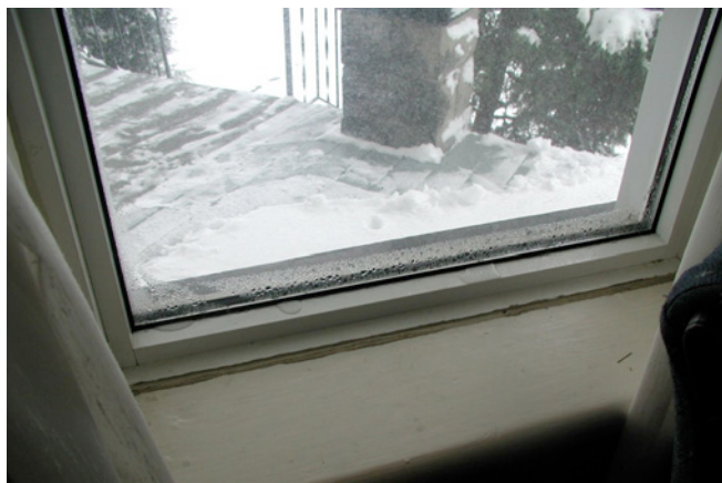
Photograph 4: Window Condensation - Interior moisture levels go up due to reduced air change and relative humidity adjacent cold window surfaces rises sufficiently to condense water. How to fix this problem? Lower the moisture content of the interior air with dilution ventilation or warm up the surface of the windows by replacing the windows with better windows or do both.

So here we are 30 years later. Different country. Same physics. Amory Lovins will finally get to make his mark in the country of his birth. Energy conservation in existing homes is about to become serious business in the United States. We now know how to do it right. We