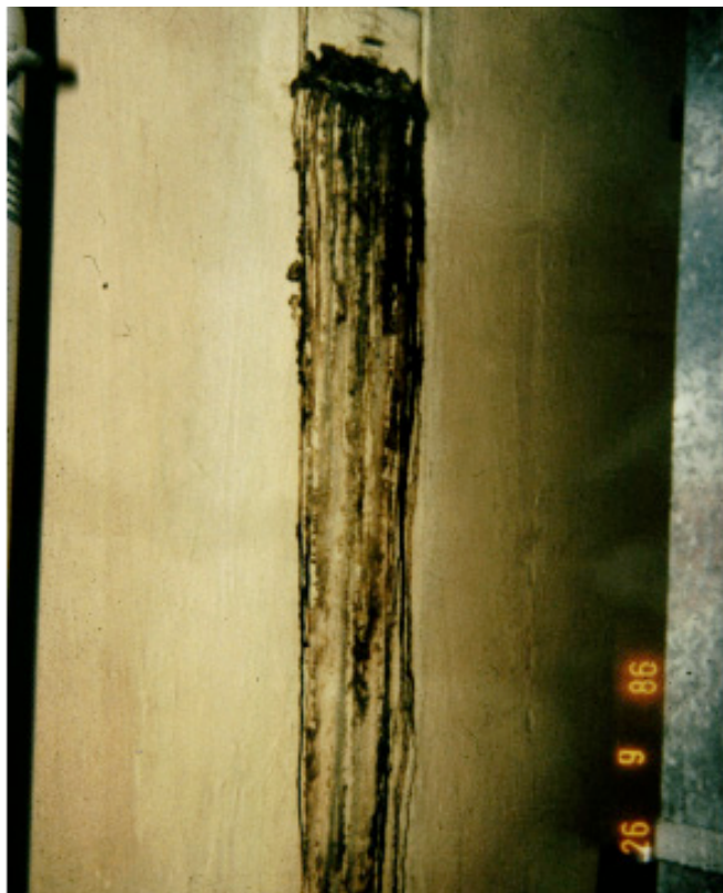
Photograph 5: Condensate Exiting Chimney Clean Out – Big danger here. Old oil furnace is replaced with a new gas furnace. New gas furnace uses existing chimney. Existing chimney is too big. Flue gases cool too quickly leading to condensation of flue gases and freeze up. How to fix this problem? Line the chimney – See Photograph 8.