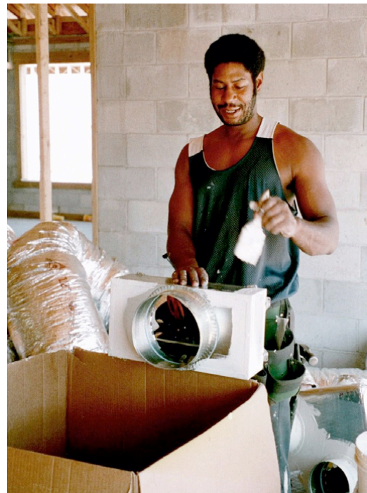
Photograph 1—Mastic Rules: I did not think I would live to see the day where mastic is used to seal all ductwork not just ductwork outside the conditioned space. Woo-hoo!

In what has become an amazing turn of events folks are figuring out how to construct tight ducts—even when they are located “inside”. Mastic rules ( Photograph 1 ). All of this is good. The only place air should exit a duct or enter a duct is at a grille or register. So what is the problem?