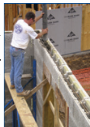
The wood fiber-cement block was selected for its ability to handle moisture in the building enclosure.

engineered wall assemblies, and painstaking attention to moisture control details.