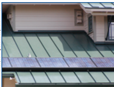
Outside air intakes neatly tucked under a second story eave.

Building America Zero Energy Home of North Texas will long stand as a testament to durability, with its ventilated claddings,