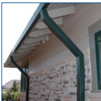
Durability is all in the details—wrap-around overhangs, recessed windows, fibercement siding and trim, gutters, bath exhaust vents.